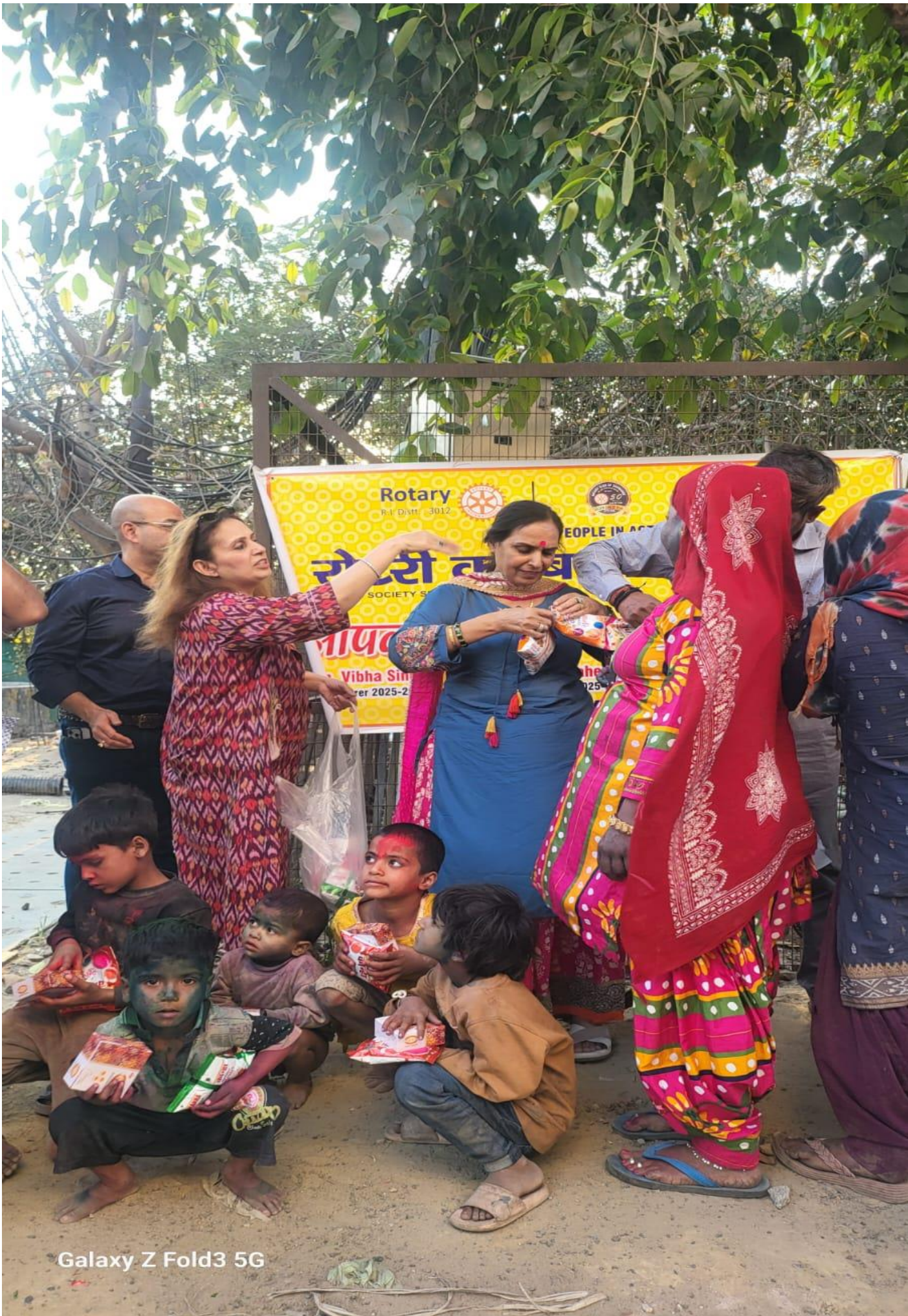
Galaxy Z Fold3 5G